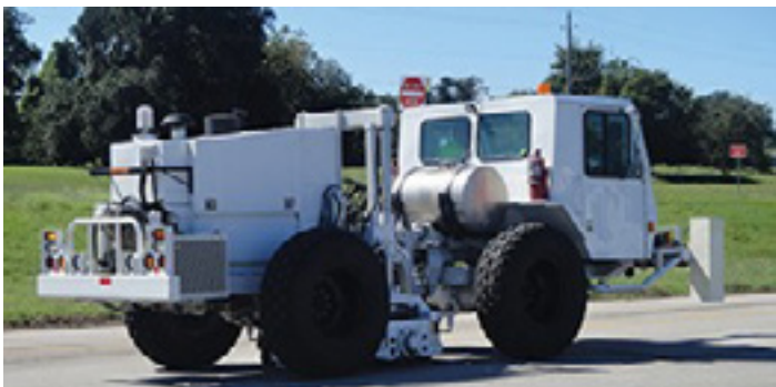
The TPAD is a highly modified geological surveying “thumper” truck designed for seismic testing. It combines rolling dynamic deflectometers with GPR.

equipment provided a much more thorough and accurate evaluation of the pavement structure than point testing, and the immediate interpretation and availability of data facilitated quick decision making.”