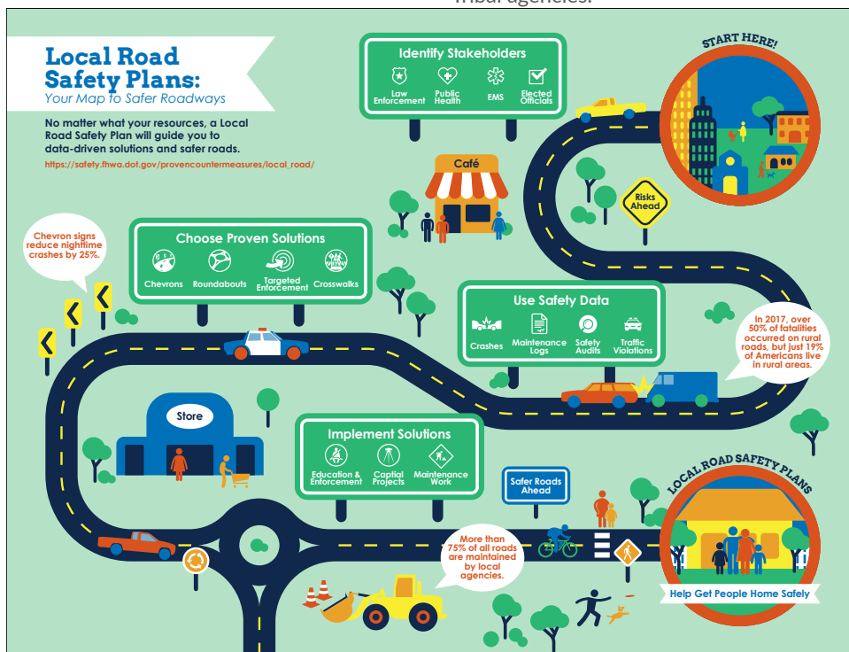
Local Road Safety Plan infographic.